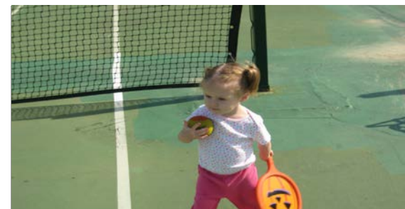
Tennis Whizz! Pre-School Programs Ages 3-5